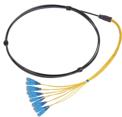
Fiber Optic Cable Assembly, 12 SC/UPC to Stub, 12-fiber, 300 Feet