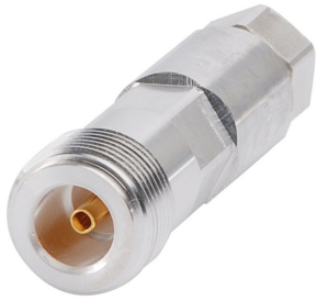
Type N Female for 1/4 in FSJ1-50A cable