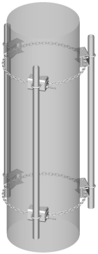
Chain Mount Base Kit, 8 ft chain